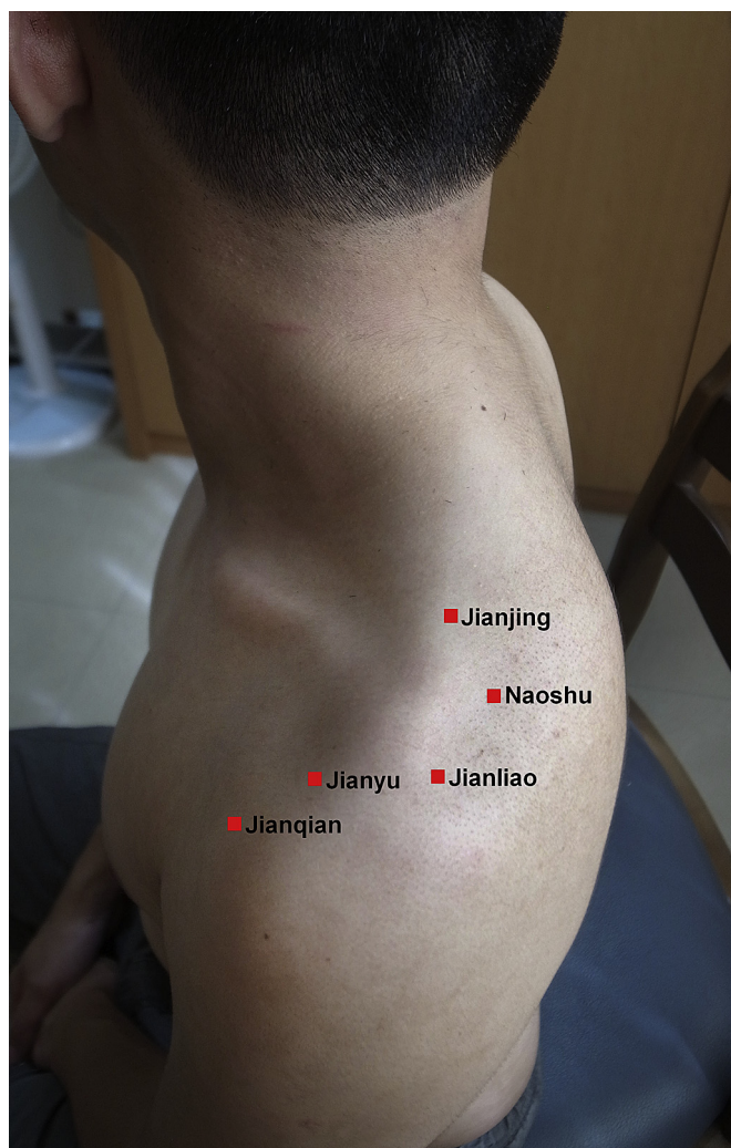
Fig. 3. Common acupoints for treating shoulder pain: (1) Jianjing: above the nipple directly, the highest portion of the shoulder; (2) Naoshu: above the posterior axillary fold directly, a depression fossa inferior to the scapular spine; (3) Jianliu: posteroinferior corner of acromion; (4) Jianyu: anteroinferior corner of acromion; and (5) Jianqian: the midpoint between the anterior axillary fold and the Jianyu acupoints.

Therefore, great attention should be paid to the prevention of adverse events that could follow acupuncture. First, we would like to emphasize the importance of the concept of an aseptic technique. Scrupulous hygienic hand disinfection could remove the transient contamination with microflora originating from previous patients. 16 Changing gloves for every patient is crucial and patient selection is also essential. Skin should be washed and disinfected with alcohol (70% ethanol or isopropanol) near the needle insertion site. Other protective equipment should also be taken into consideration, including wearing suitable clothes to avoid the spread of the infection. There should also be management of clinical and related waste, and environmental hygiene and spills. 17 The authority concerned must focus on implementing proper infection